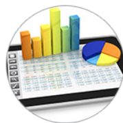
Analyze results for improved prospecting and fundraising strategies