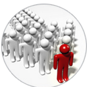
Organize and segment constituents using custom research lists

With built-in dashboards to analyze results and profile reporting to highlight major gift candidates, prospect researching has never been this efficient. ResearchPoint takes the time and effort of prospect researching away from the organization so you can focus on what really matters — engaging and cultivating with top-tier prospects.