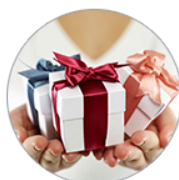
Screen for wealth and philanthropic insights to identify best prospects