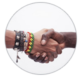
What have they given to us?

Target Analytics utilizes a combination of three data perspectives to inform the modeling effort, including: the supporter giving history recorded by the client, supporter giving to other organizations collected by Target Analytics, and hundreds of wealth and demographic attributes integrated from outside sources. That mix of data assets provides the organization with a holistic view of each supporter, expanding beyond historical relationships, taking into account not only their overall philanthropic tendencies, but also factors such as their life-stage, liquidity, and capacity. The end result of a ProspectPoint engagement is a ranked and prioritized supporter base, recommended treatment for each constituent, well-armed and more confident client, and ultimately, far more effective and efficient fundraising program.